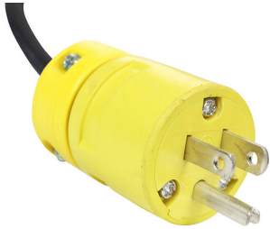
5-15 Straight Blade Plug 15 Amp / 125V Rated