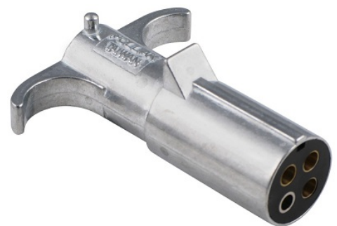
4-Pin Round Connector