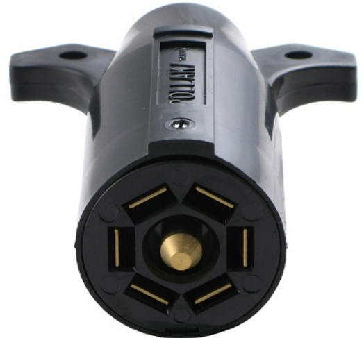
7-Pin Flat Connector