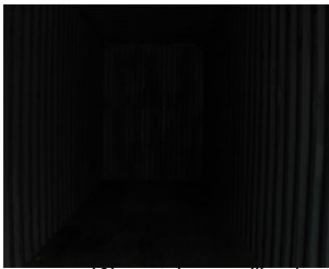
40' container no illumination