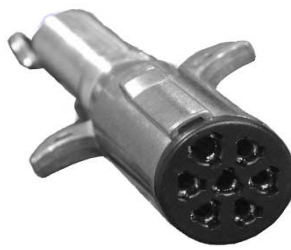
7-Pin Round Connector