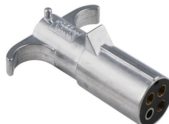
4-Pin Round Connector