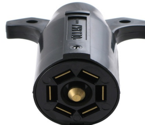
7-Pin Flat Connector