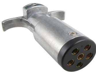
6-Pin Round Connector