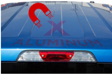
Aluminum Body is Not Magnetic

Having a reverse camera or an LED for the 3rd brake light will change the mounting bracket design. Those with a camera or LED must choose the "camera" option in order to get the correct design. Please choose the appropriate option below.