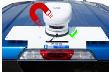
MMP-FSD-2002 Steel Plate is Magnetic

Applications: Off-roading, property management, security, search and rescue, farming operations and any other applications for which a roof mounted spotlight is needed for 2002 model year Ford F250-F550 truck owners.