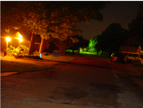
2800 foot street with normal lighting.

This rechargeable LED light is weatherproof and resists the intrusion of water and dust. A booted push button switch on the top and a flat bottom surface makes the RL-11-LED a popular handheld, weatherproof work light for indoor and outdoor use.