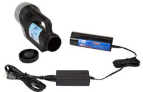
14.4V 5,000mAh Lithium-ion Battery