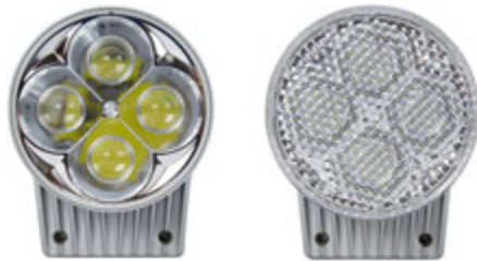
Spot to Flood Lens