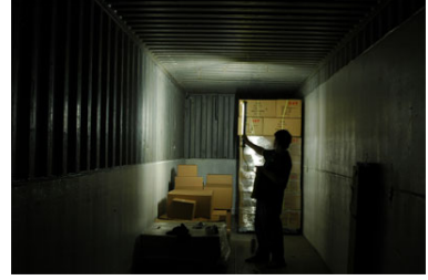
Container With EPL-FL1524-LED