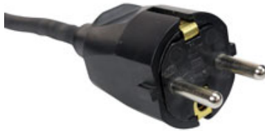
Intl Schuko 2-Pin Plug 16 Amp / 250V Rated / Grounded