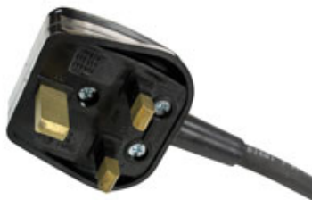
UK BS1363 Straight Blade Plug 13 Amp / 250V Rated / Internal Fuse