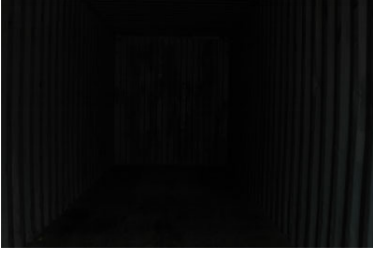
40' Container Dark