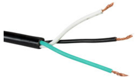
Flying Leads / Pigtail Wires

Wiring and Plug: This explosion proof LED drop light is equipped with 50 foot of 16/3 chemical and abrasion resistant SOOW cord that is fitted with an industrial grade cord cap for easy connection to common wall outlets. Plug options include standard 5-15 15 amp straight blade plug for 110V wall outlets with ground, standard 6-15 15 amp straight blade plug for 240V wall outlets with ground, NEMA L5-15 15 amp twist lock plug for 125V twist lock outlets, NEMA L6-15 15 amp twist lock plug for 240V twist lock outlets, British BS1363 13 amp fused 3-blade plug for United Kingdom outlets, or a two pin 16 amp rated Schuko plug with ground contact and socket for European outlets up to 250V. Alternatively, we can provide flying leads with no plug for hard wire applications or for operators who prefer to wire in user provided cord caps. Please choose