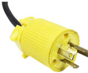
L5-15 Twist Lock Plug 15 Amp / 125V Rated