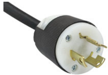
L6-15 Twist Lock Plug 15 Amp / 250V Rated