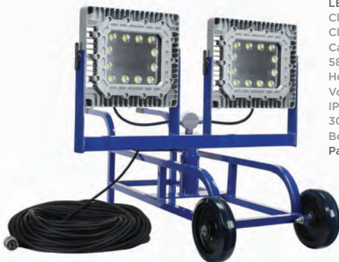
EXPLOSION PROOF MOBILE LED LIGHT CART Class I, Divisions 1 & 2 Class II, Divisions 1 & 2 Cart Dimensions: 58.73"L x 19.3"W x 17.86"H Head Dimensions: 6"L x 40"W x 18.68"H Voltage: 120-277V AC 50/60Hz IP67 Rated Waterproof 300 Watts - 26,000 Lumens Beam Angle: 60° or 125° Part # EPL-48-100LED-SFC