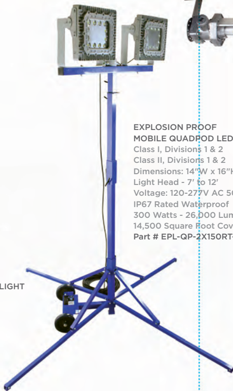
EXPLOSION PROOF MOBILE QUADPOD LED LIGHT Class I, Divisions 1 & 2 Class II, Divisions 1 & 2 Dimensions: 14"W x 16"H x 5"D Light Head - 7' to 12' Voltage: 120-277V AC 50/60Hz AC 50/60Hz IP67 Rated Waterproof 300 Watts - 26,000 Lumens 14,500 Square Foot Coverage Part # EPL-QP-2X150RT-100