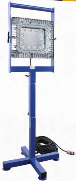
EXPLOSION PROOF MOBILE 5' LED LIGHT Class I, Divisions 1 & 2 Class II, Divisions 1 & 2 Voltage: Universal Voltage 120-277V AC 50/60Hz IP67 Rated Waterproof 150 Watts - 13,000 Lumens Part # EPL-24BS-5FT-1X150LED-100