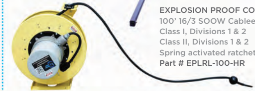
EXPLOSION PROOF CORD REEL 100' 16/3 SOOW Cable Class I, Divisions 1 & 2 Class II, Divisions 1 & 2 Spring activated ratchet Part # EPLRL-100-HR