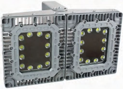
EXPLOSION PROOF HIGH BAY LED LIGHT FIXTURE Class I, Divisions 1 & 2 Class II, Divisions 1 & 2 Dimensions: 28" L x 16" W x 5" D IP67 Rated Waterproof 300 Watts - 26,000 Lumens Beam Angle: 60° or 125° Part # EPLC2-HB-2X150LED-RT