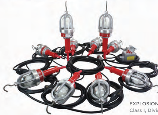
EXPLOSION PROOF LED STRING LIGHTS Class I, Divisions 1 & 2 Class II, Divisions 1 & 2 Wiring: 100' 14/3 SOOW Cable -20A EXP Plug Total Length: 125' 100 Watts - 11,600 Lumens Voltage: 120-277V AC or 12-24V DC Part # EPL-SL-10-LED-E2E