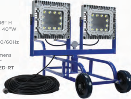
Class I, Divisions 1 & 2 Class II, Divisions 1 & 2 Cart Dimensions: 58.73" L x 19.3" W x 17.86" H Head Dimensions: 6"L x 40"W x 18.68"H Voltage: 120-277V AC 50/60Hz IP67 Rated Waterproof 300 Watts - 26,000 Lumens Beam Angle: 60° or 125° Part # EPL-16C-2X150LED-RT