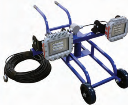
EXPLOSION PROOF MOBILE LED LIGHT CART Class I, Divisions 1 & 2 Class II, Divisions 1 & 2 Voltage: Configurable 120V-60hz 220V-50hz 240V-60hz 277V-60hz 140 Watts - 11,600 Lumens Beam Spread: 360° or 180° Part # EPL-C-2X70-LED