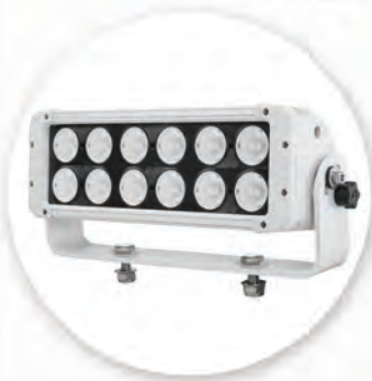
HIGH INTENSITY LED LIGHT BAR 120 Watts - 10,320 Lumens Trunnion Mount 9 to 46 volt compatibility 20° wide spot beam 40° wide flood beam Available in Black or White Part # LEDP10W-120X2ET