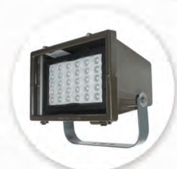
HAZARDOUS LOCATION LED LIGHT FIXTURE Class 1 Division 2 Groups A, B, C and D UL 1598 Outdoor Marine Use IP68 RATED - WATERPROOF 150 Watts - 14,790 Lumens Dimensions: 11"H x 15"W x 14"D Part # HAL-PRM-150W-LED