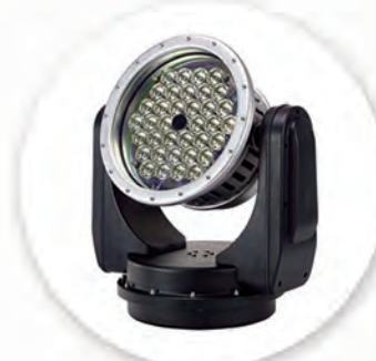
REMOTE CONTROL SPOTLIGHT Weatherproof Wireless Remote (100' Range) Weatherproof Housing 80 Watts - 7,400 Lumens Magnetic Mount 2,000' Beam 120 Volt AC or 24 Volt DC Adjustable from spot to flood Part # RCL360-LED-80W