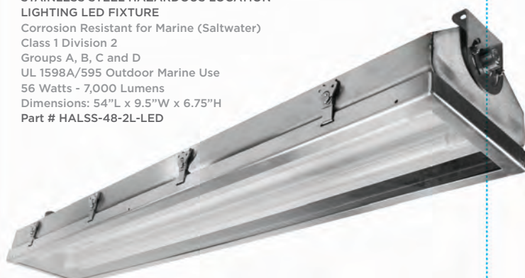
Corrosion Resistant for Marine (Saltwater) Class 1 Division 2 Groups A, B, C and D UL 1598A/595 Outdoor Marine Use 56 Watts - 7,000 Lumens Dimensions: 54"L x 9.5"W x 6.75"H Part # HALSS-48-2L-LED