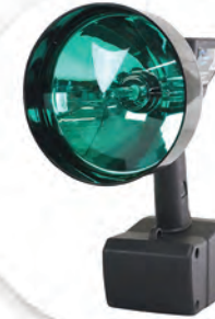
HANDHELD HUNTING LIGHT 35 WATT HID SPOTLIGHT/FLOOD 1900' Spot Beam Rechargeable Lithium Ion 12-24V/110-240V Available in Green, Red, White, IR 850nm and 940nm Part # RL-85-HID-GREEN