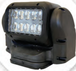
GOLIGHT STRYKER Magnetic or Surface Mount Wired Dash Mount Remote Control Weatherproof Available in Black, White, Chrome, or Camo housing Available in LED, HID, Halogen, Visible/IR (850nm and 940nm) Part # GL-4600