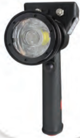
INFRARED LED PISTOL GRIP SPOTLIGHT 1,800' X 175' Beam Rechargeable Lithium Ion 120V Charger IR 850nm and 940nm Part # RL-85-3W1-IR