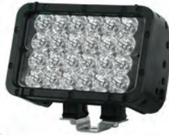
INFRARED LED LIGHT BAR 12 Red LEDs, 12 White LEDs IP68 RATED - WATERPROOF IR 850nm and 940nm versions Spot Beam: 800'L x 100'W Flood Beam: 275'L x 240'W Available in Black or White housing Available in visible, red, green, infrared, visible/infrared lights Part # LEDLB-24E-VISRED